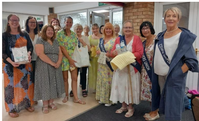
Presentation of some items to the health visitors

Well done and thank you for all the hard work and sharing your news and photos.