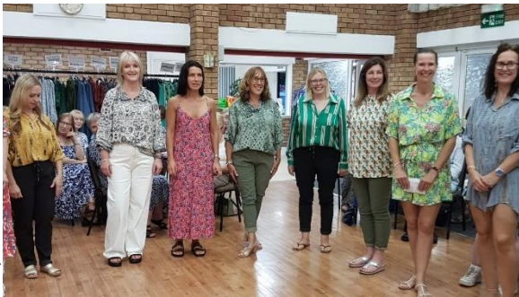
Some of the models

On September 8 th Mothers' Union members held a fashion show and sale to raise funds to buy items for the Gem Centre in Wolverhampton which supports vulnerable mums and young families. Over 130 people attended to enjoy a buffet, the fashion show and take the opportunity to buy fashion items.