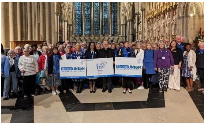
Out of the rain at last!

This campaign is not intended to replace the 16 Days or the #Nomore1in3 but to enhance both and become a 365 Days' campaign.