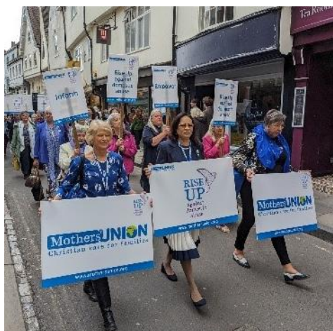
On the way - before the rain!