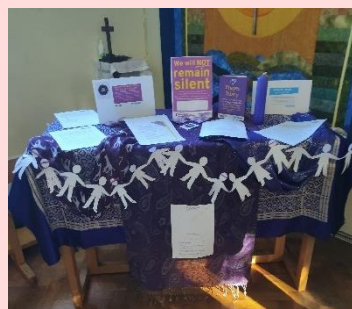
Wigginton Prayer Table

Branches across the diocese came together to pray during the 16 days of Activism against Gender Based violence.