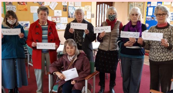
Shrewsbury St Giles #No More 1in3